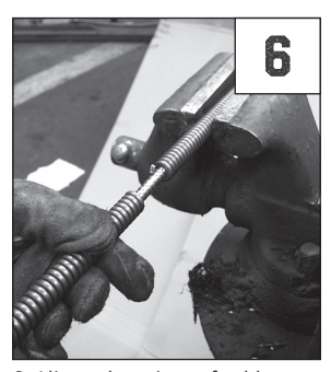
6. Align other piece of cable onto splice core.