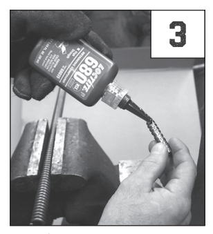
3. Apply Loctite Retaining Compound to splice core.