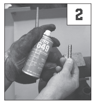
2. Spray Loctite Primer in and around the cable end and splice core to thoroughly remove grease and grime.