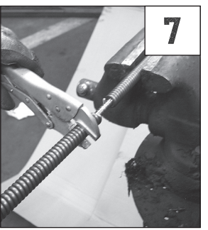
7. Place vise grips on free cable end and turn counterclockwise.