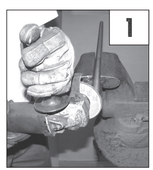
1. Cut a few inches off of each cable end and remove any burrs with a grinding disk or file.