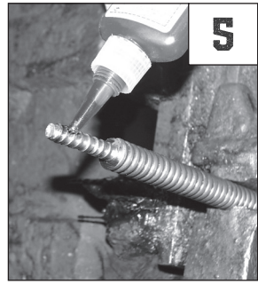
5. Apply Loctite Retaining Compound to other end of splice