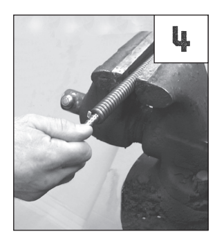
4. Insert splice core into cable one turn.